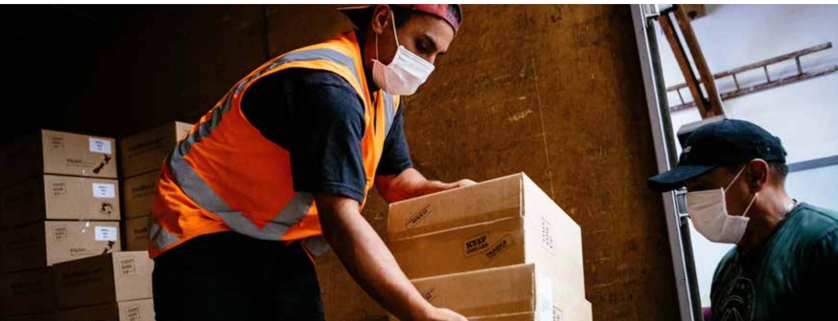
Food was collected and repackaged for delivery to families in the Tāmaki region

With the onset of Covid-19, everyone has been affected in some way. People have lost jobs and businesses saw their incomes reduce. But throughout this crazy time, the community of Tāmaki has showed its amazing spirit and resilience – and there is a range of new initiatives coming to support people with the many challenges posed by this pandemic.