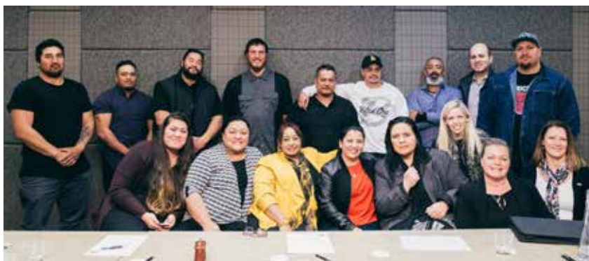
Eight Tāmaki locals signed up for apprenticeships in July